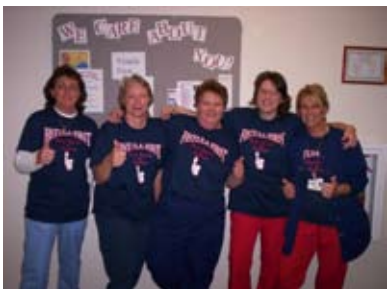
Gearing up for Fistula Awareness Week October 24-28, 2005 Regional Dialysis, Michigan.

Increasing their facility AV fistula rate from 28.1% in October 2003 to 39.8% in September, 2005, Regional Dialysis in Midland, MI has made outstanding progress in AVF improvement. How did they do it? Their focus has been patient education and follow-up, as well as collaboration with the facility, nephrologist, and the surgeon. They plan to continue their efforts in improving their AVF rates through regular meetings with their nephrologists and participating surgeons.